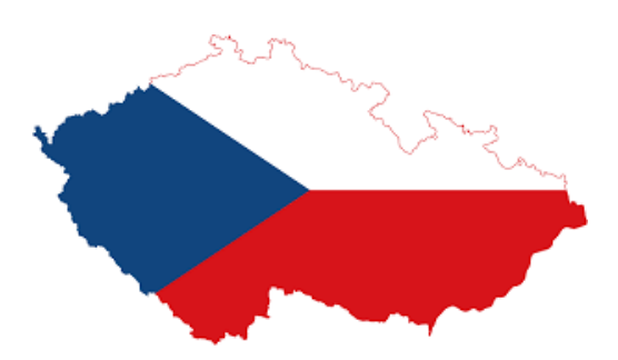
Central Europe 10.6 mil citizens 194 hospitals 50,802 doctors EU member since 2004 GDP 22,762 USD p.c.